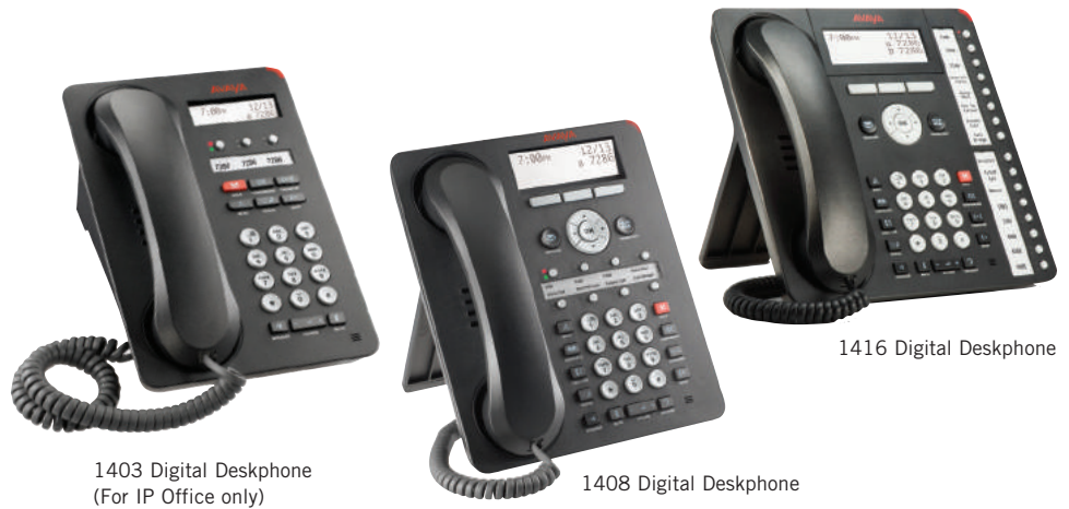
1403 Digital Deskphone (For IP Office only)

The 1400 Series Digital Deskphones combine traditional telephone features such as dual LED indicators and fixed feature buttons (e.g., conference, transfer, hold) with contemporary innovations such as softkeys, navigation wheel and a context-sensitive user interface.